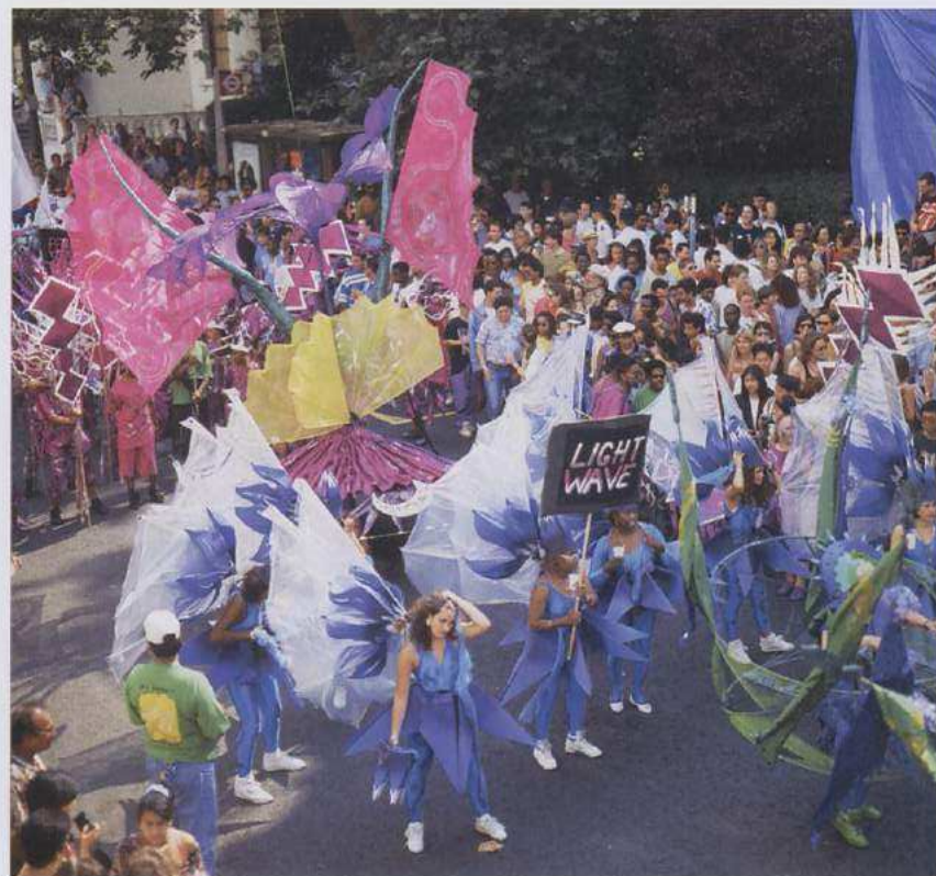
Colour on a summer day in the streets of Notting Hill

Today, people from many countries live in every area of the city. You can hear more than 250 languages on the streets of London, and the city is changing all the time. From 1993 to 2002, 726,000 people from other countries moved to London. Today, a lot of people come from countries in the east of Europe. London really is 'the world in one city'.