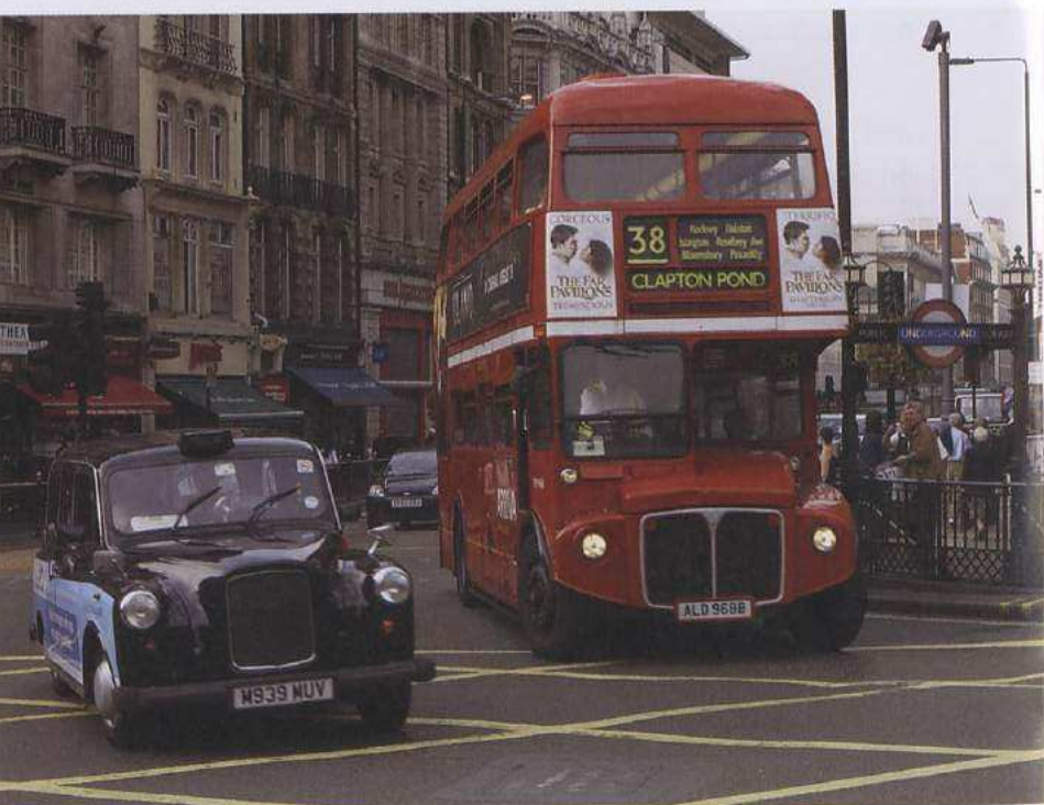
London is famous for its black taxis and red buses.

The city has eight big train stations, too. You can catch a train from London to Paris or Brussels now. Many people live outside London and come into the city for work every day. Children know about King's Cross station because it is the train station in the Harry Potter books.