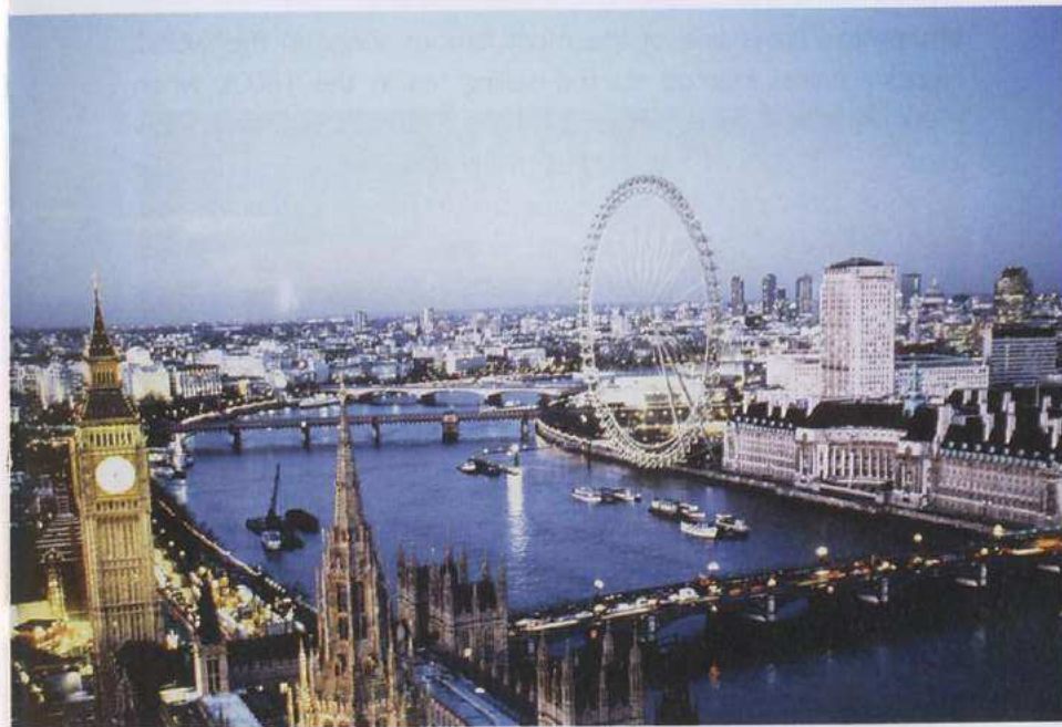
Old and New – the London Eye looks down on Big Ben's tower.

The British fought Napoleon's ships in 1805 and won. The city wanted to remember this, so in 1841 they built Trafalgar Square . Today, you can find a lot of visitors – and birds! – in the square.