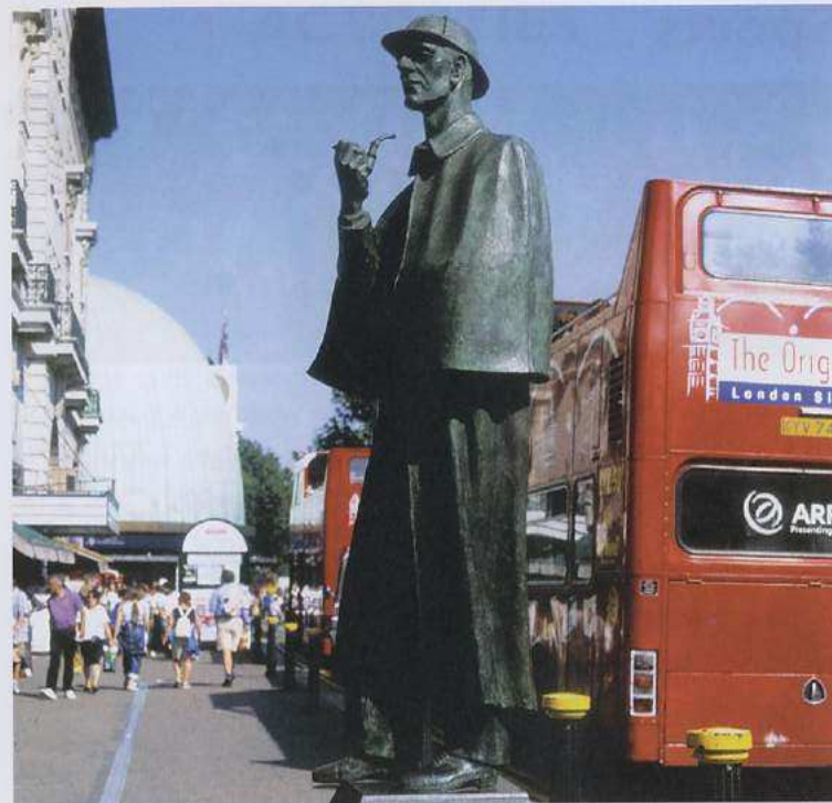
Sherlock Holmes looks up to his old home in Baker Street.

George Orwell (1903–1950) wrote his most famous book, 1984 , about a London of the future. Orwell also wrote about difficult lives in the city in his book Down and Out in London and Paris .