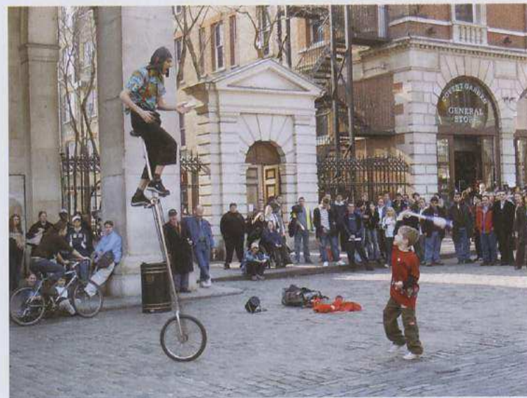
A child enjoys his visit to Covent Garden.

When Londoners are hungry, and tired of shopping, they can go to one of the 11,000 eating places in the city. You can eat food from round the world. You can eat in famous, very expensive restaurants or in cheap little cafés. In the afternoon, you can have 'afternoon tea' – tea, sandwiches and cake – in one of the city's famous hotels.