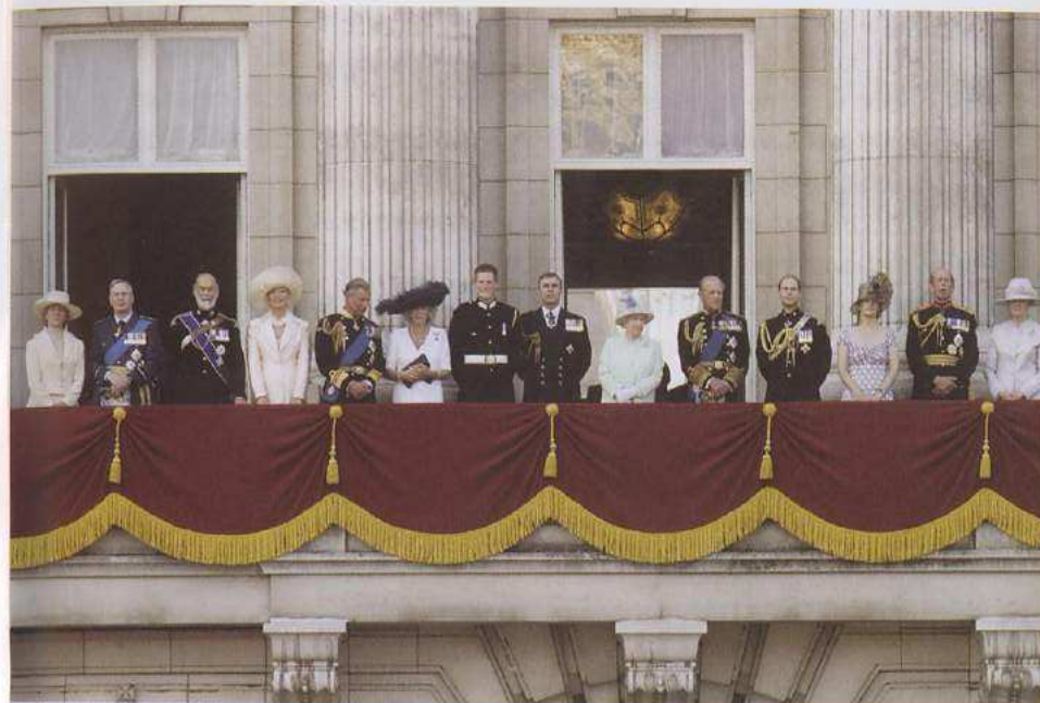
Queen Elizabeth II and her family outside Buckingham Palace

Many of London's parks were gardens for kings and queens. Londoners could walk in Hyde Park and St James's Park for the first time in the 1600s.