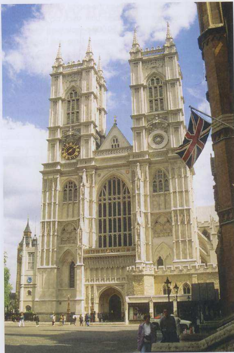
King Henry III built a new Westminster Abbey two hundred years later. You can see this great building in Westminster today.