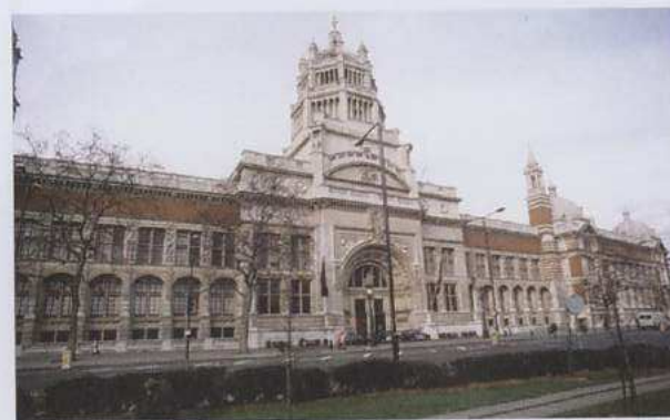
There are many fine treasures in the Victoria and Albert Museum.

But the old museum building was too small, so now there are two Tates in London. The new Tate museum opened in the year 2000, by the River Thames. There is art of the 1900s, with work by Picasso, Matisse and Warhol. The old Tate museum is now 'Tate Britain'.