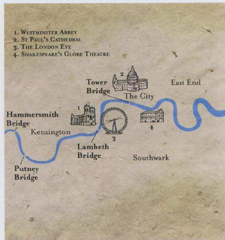
The River Thames runs through the centre of the city.

The river helped London in many ways, but it also brought problems. For years, people threw things into it. The city's toilets ran into the river, too. The river was very dirty and its water was dangerous. By the 1950s, there were no fish. Today, things are different. The water is cleaner, and fish swim in the Thames again.